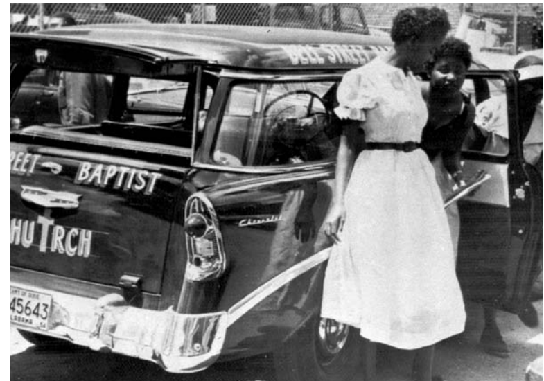
A church-operated station wagon provided transportation to blacks during the Montgomery bus boycott.

Martin became the leader of the Montgomery bus boycott. People supported the boycott by walking or carpooling, but they would not ride the buses. The boycott went on for over a year. The city would not change the segregation law. Many angry threats were made to Martin and his family. Once, their house was bombed. No one was hurt, but Martin realized that he and his family were in danger. In November 1956, the boycott ended in victory for the African American community. Soon after that victory, the Supreme Court ruled that Alabama could no longer segregate riders on buses.