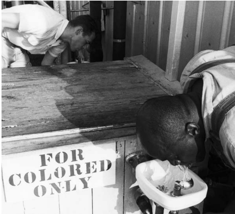
Black men drink from fountains labeled "For Colored Only."

These laws, called Jim Crow laws , deprived blacks of many rights. Black children went to separate, poorer schools than white children. On buses, blacks had to sit in the back seats—and give up those seats if whites wanted them. Blacks were forced to use public drinking fountains and restrooms marked "For Colored Only." (In earlier days, African Americans were called "Colored.") White people used drinking fountains and restrooms that were marked "For Whites Only."