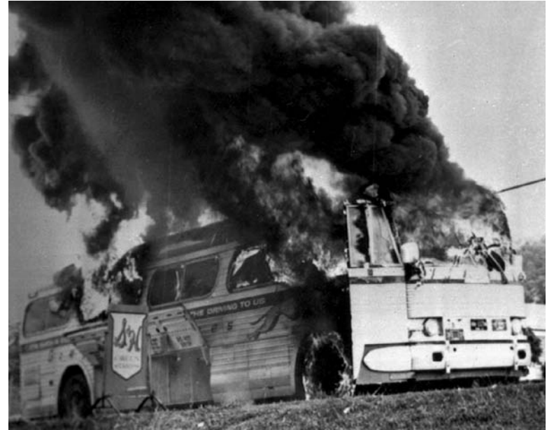
This Freedom Riders bus was firebombed in Alabama in 1961. Passengers escaped without serious injury.

Courageous blacks started to test the unfair laws of segregation. In 1960, small groups, often students, began sit-ins at lunch counters where only white people could be served. (During a sit-in people sit somewhere and refuse to move as a form of peaceful protest.) While the blacks sat in their seats, angry whites often pushed or beat them. But in time, the sit-ins were successful. By the end of the year, more than a hundred Southern towns had integrated their lunch counters.