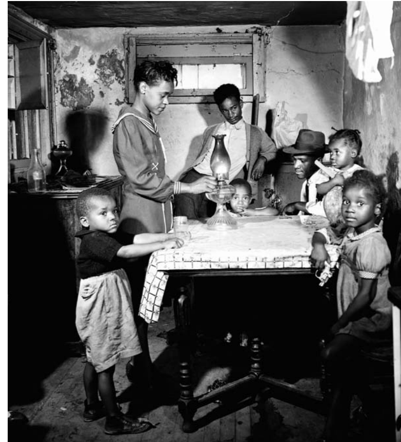
A poor family in their Washington, D.C., apartment

These laws, called Jim Crow laws , deprived blacks of many rights. Black children went to separate, poorer schools than white children. On buses, blacks had to sit in the back seats—and give up those seats if whites wanted them. Blacks were forced to use public drinking fountains and restrooms marked "For Colored Only." (In earlier days, African Americans were called "Colored.") White people used drinking fountains and restrooms that were marked "For Whites Only."