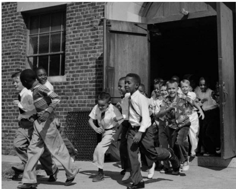
Children at an integrated school in Washington, D.C., in 1954