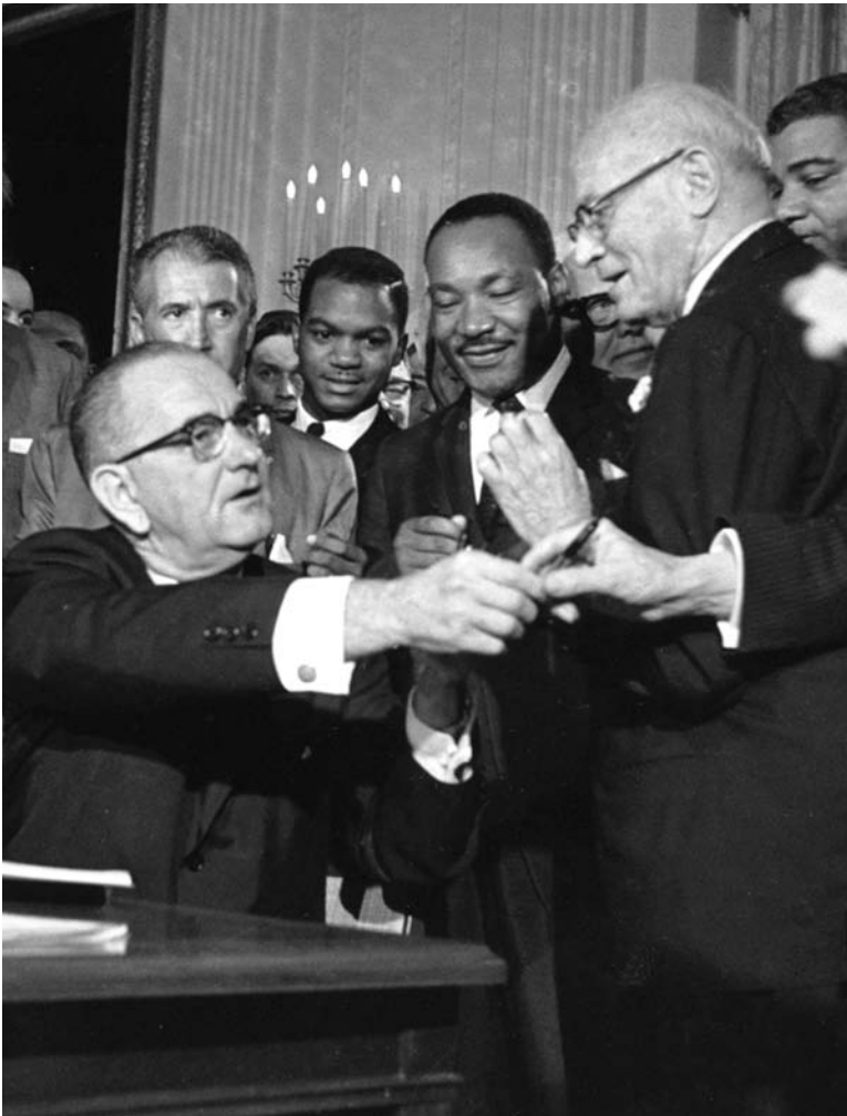
President Lyndon Johnson signs into law the Civil Rights Act.

Sadly, three months later, President Kennedy was assassinated . But the Civil Rights Act, which he supported and which ended segregation in all public buildings, became law in 1964.