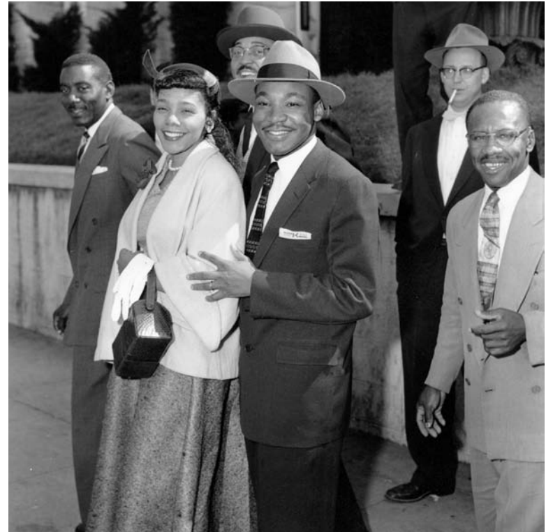
This photo of Rev. Martin Luther King Jr. and his wife, Coretta, was taken three years after they married.

While he was up north, Martin met his future wife, Coretta Scott. She was studying to become a singer. On their first date, Martin told Coretta he wanted to marry her. He liked her for her beliefs and her commitment to equality , as well as her beauty. In the summer of 1953, they got married. A year later, Martin took his first preaching job at a Baptist church in Montgomery, Alabama.