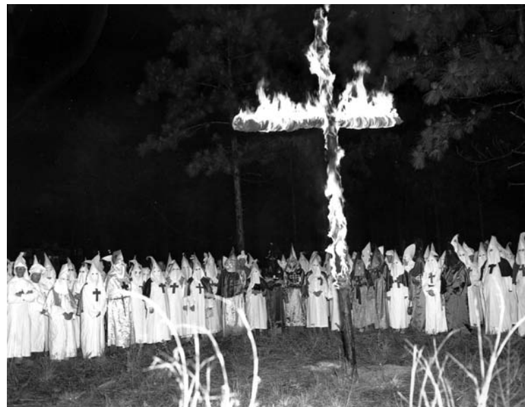
Members of the KKK burn a cross at a meeting.

In 1954, the United States Supreme Court ruled that schools could no longer be segregated, or divided, by race . The Court ordered schools to integrate so that different races could attend the same school. With this important ruling, African Americans became very hopeful that they could change society. Martin and other leaders encouraged people to work together peacefully to win civil rights for everyone, no matter their race or religion.