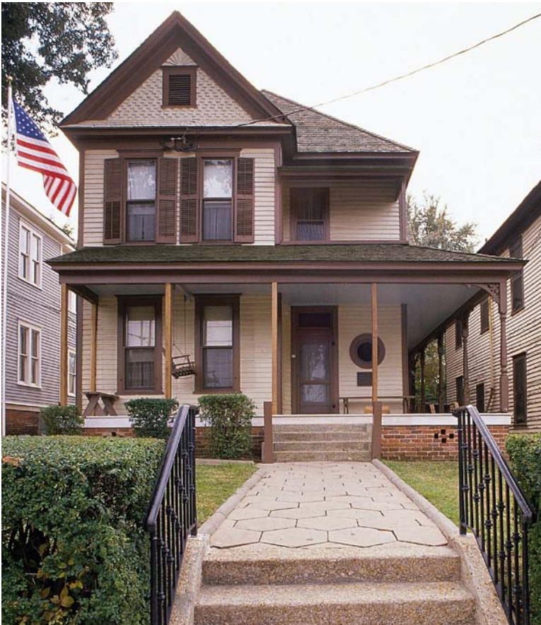
The childhood home of Martin Luther King Jr.

Martin Luther King Jr. was born in Atlanta, Georgia, on January 15, 1929. His father was a Baptist minister, and his mother was a teacher. Martin grew up in a busy and loving family. He and his sister and brother studied, took music lessons, and played sports.