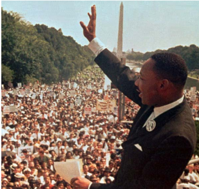
Martin Luther King Jr. at the Lincoln Memorial, 1963