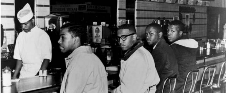
A 1960 sit-in at a whites-only lunch counter