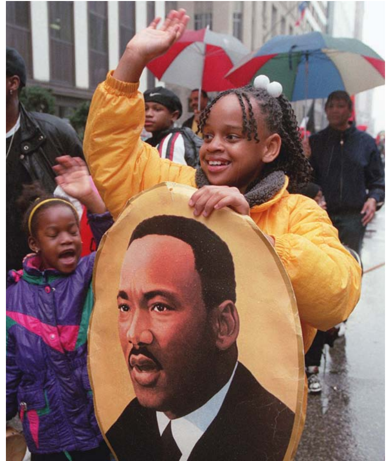
A girl marches in a Martin Luther King Day parade.