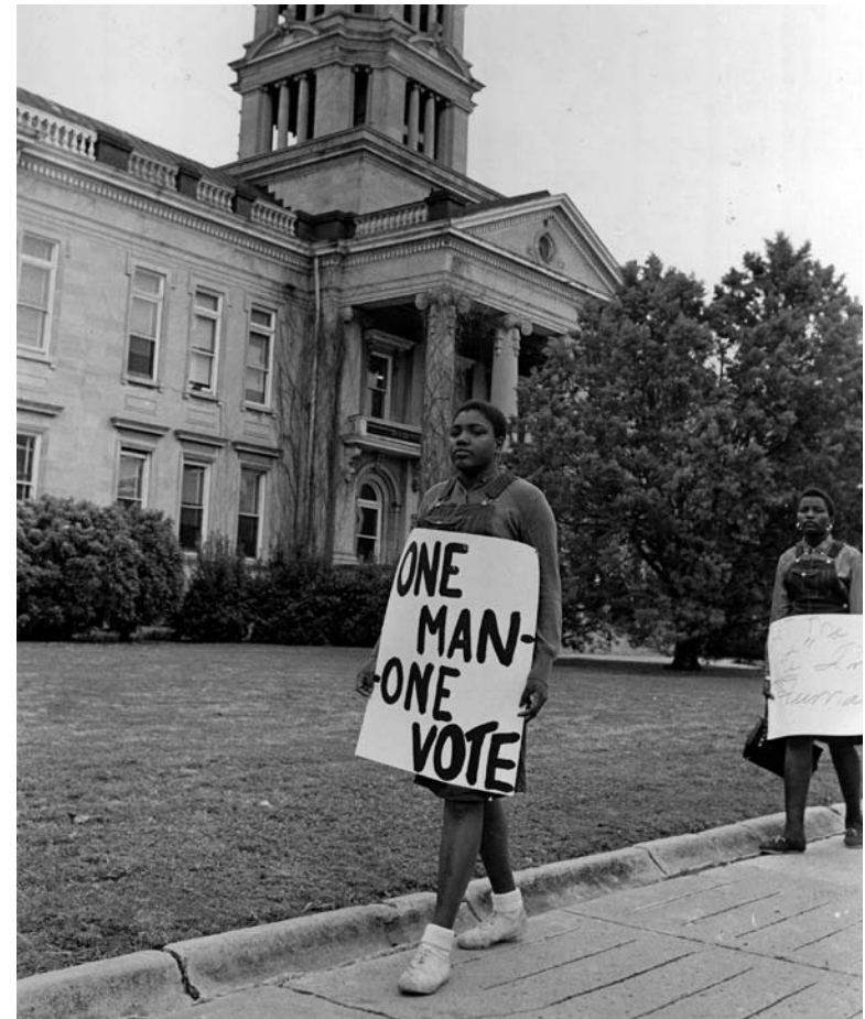
Civil rights supporters stage a peaceful demonstration for voting rights in Mississippi in 1964.

The next struggle for blacks was for voting rights. In the South, some whites made it nearly impossible for many blacks to vote. In some places, they charged a special tax many poor people could not afford. Those who failed to pay the tax were not allowed to vote.