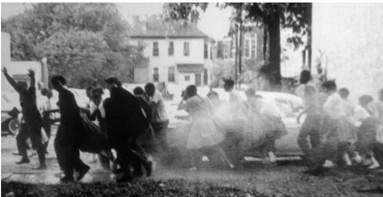
A group of marchers run for safety as they are sprayed with powerful fire hoses.

In April 1963, Martin led the famous Birmingham March to stop segregation in the city. The marchers were met by Police Chief “Bull” Connor and his men. Attack dogs were set loose on the marchers, even on children. The marchers were sprayed with high-pressure fire hoses. Many were seriously injured. More than 3,000 African Americans were arrested and jailed. President Kennedy sent U.S. troops to Birmingham to stop the violence. Finally, the city ended its segregation laws. Television and newspaper reports of the violence in Birmingham made more and more people aware of the unfair and harsh treatment of African Americans. It brought more attention to the need for equal rights for all people.