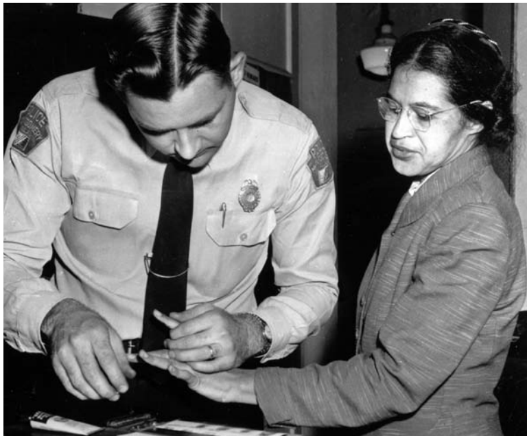
Rosa Parks is fingerprinted in Montgomery, Alabama.

In December 1955, something important happened in Montgomery, where Martin and his family were living. A black woman named Rosa Parks refused to give up her seat on a bus to a white man. She was arrested. The black citizens of the city were outraged, and they decided to protest . They refused to ride city buses because they wanted an end to segregation on the buses. This kind of protest, in which people refuse to participate in something in order to force a change, is called a boycott . It is a peaceful means of protest.