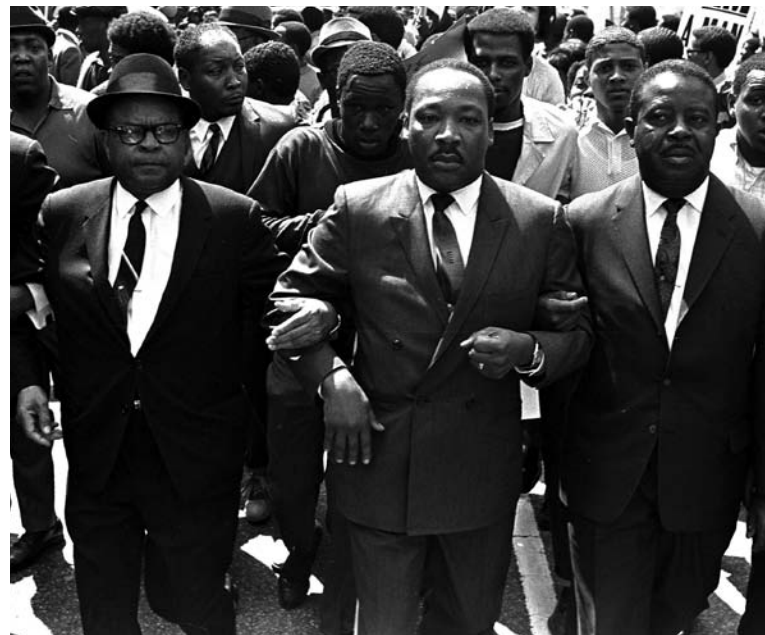
Martin Luther King Jr. participates in a civil rights march in Memphis days before his assassination.

In Selma, Alabama, Martin led long lines of African Americans to the registration offices. He was arrested for his action and later released. Then the marchers started marching on the road from Selma to Montgomery. They wanted to present a complaint to the governor of Alabama, George C. Wallace. But he ordered the march stopped. The marchers continued and were stopped by state troopers who used tear gas and clubs to stop the marchers. The day is remembered as Bloody Sunday. Later, on August 6, 1965, with the support of President Johnson, the Voting Rights Act was passed in Washington, D.C. It was a great victory for all people.