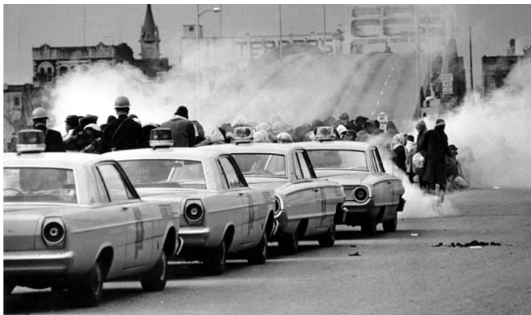
Following Alabama Governor George Wallace's orders, state troopers use tear gas on peaceful demonstrators.

In Selma, Alabama, Martin led long lines of African Americans to the registration offices. He was arrested for his action and later released. Then the marchers started marching on the road from Selma to Montgomery. They wanted to present a complaint to the governor of Alabama, George C. Wallace. But he ordered the march stopped. The marchers continued and were stopped by state troopers who used tear gas and clubs to stop the marchers. The day is remembered as Bloody Sunday. Later, on August 6, 1965, with the support of President Johnson, the Voting Rights Act was passed in Washington, D.C. It was a great victory for all people.