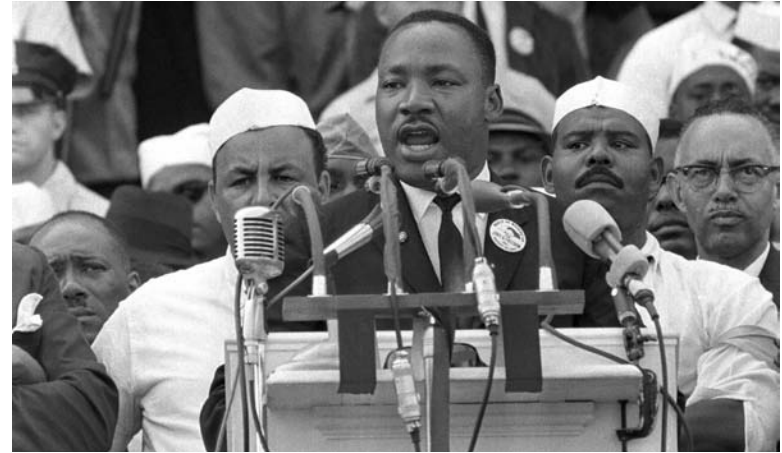
Martin Luther King Jr. gives his famous “I Have a Dream” speech.